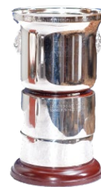
Wrinklies Rice Bowl

The Wrinklies Rice Bowl will be awarded to the winner at the End of Season Celebration Dinner scheduled on 9 June 2024 (Sun) at the New Clubhouse, Beas River Country Club.